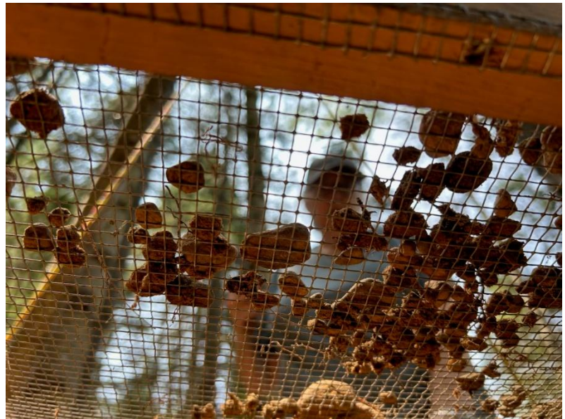
An artsy image of some screening activity at the Dickerson Site.

Page 16 2026 Chapter Executive, OAS/Chapter info, Upcoming articles, Appreciation