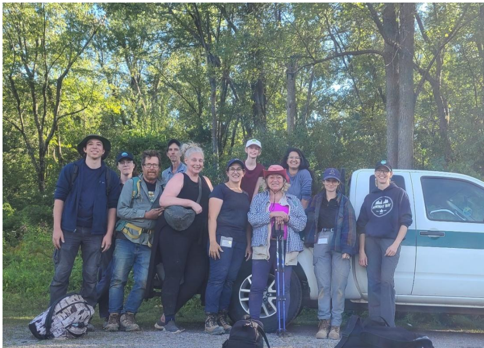
Employés de la CCN et bénévoles à la fin des fouilles publiques en 2025.

J'adore faire partie de l'équipe de bénévoles, car je peux pratiquer l'archéologie ici même à Ottawa, sans avoir à parcourir le monde. L'excitation de découvrir des poteries lors de fouilles, ou de déchiffrer une inscription sur un objet en verre historique (la dernière fois, c'était une bouteille de ketchup de 1952) : voilà ce que je préfère dans l'archéologie. Elle me permet de partager mes passions et de rencontrer de nouvelles personnes. C'est un lieu où je me sens à ma place et où je peux être moi-même. »