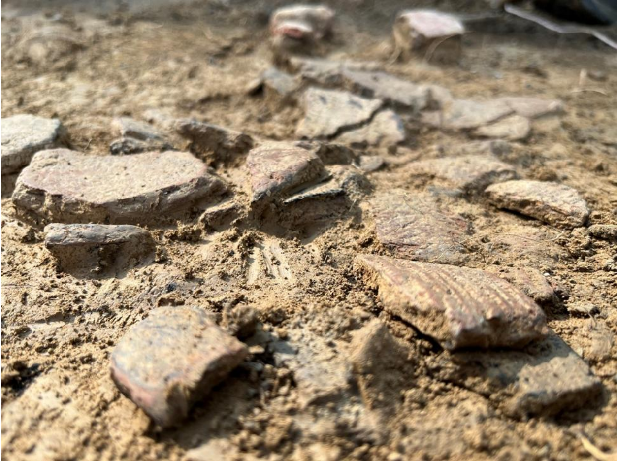
Indigenous Pottery at the NCC 2025 Public dig.

Once the field season was over, volunteers were able to participate in lab work, washing, sorting, and cataloguing artifacts that had been found during their time in the field with us. This ‘hands on’ lab work sparked some great conversations about history, context, and allowed volunteers to get a chance to understand how stone tools were made if they hadn’t had the chance to participate in fieldwork volunteer opportunities. So many flakes to wash! Some volunteers even helped put our ‘puzzle pieces’ of artifacts back together.