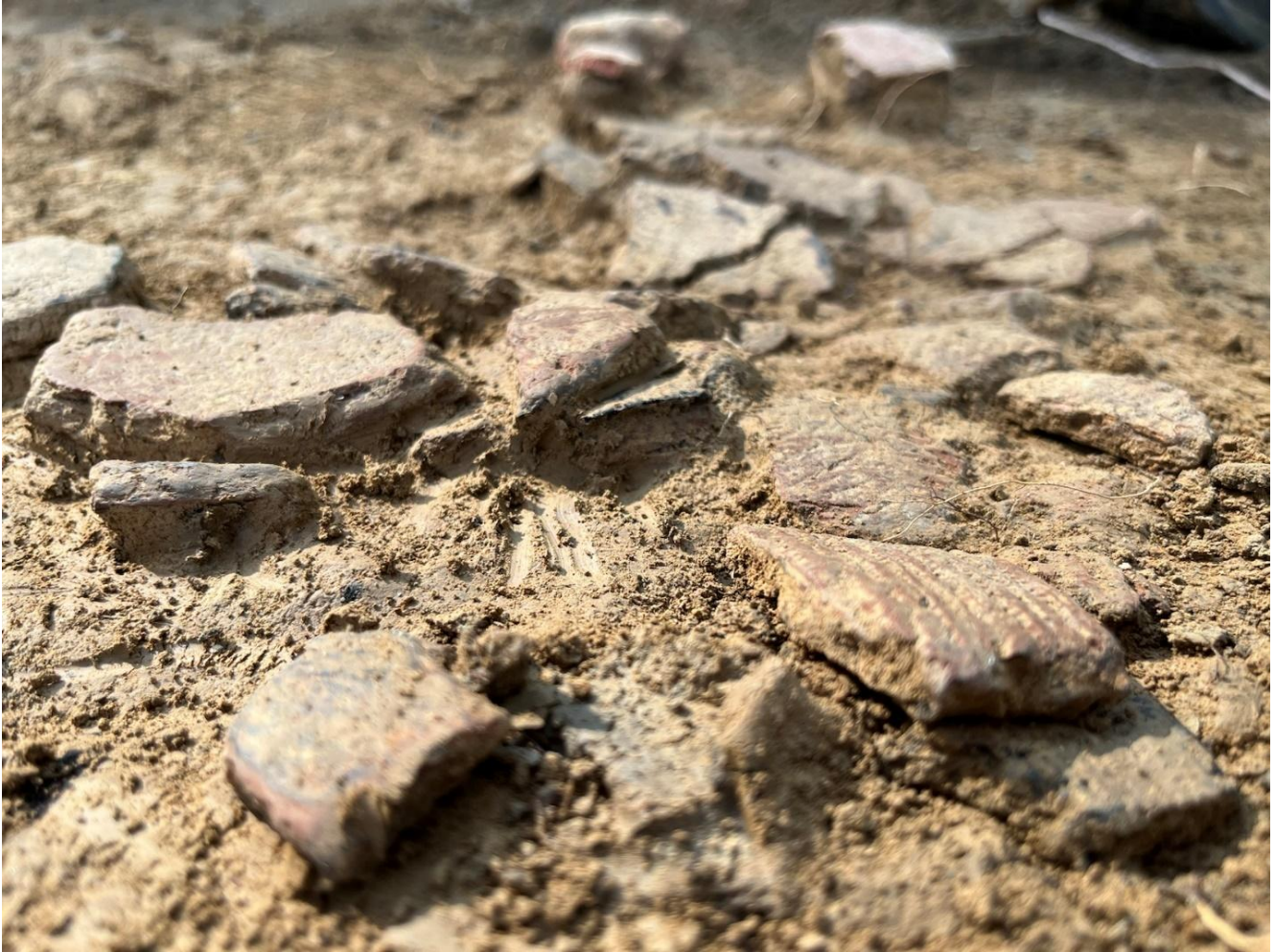
Poterie autochtone lors des fouilles publiques de CCN 2025.

Des bénévoles de partout dans la région de la capitale nationale, des deux côtés de la rivière, participent à nos activités. L'un d'entre eux est même venu de Toronto pour une séance de laboratoire! Nos bénévoles sont de tous âges et de tous horizons : de jeunes passionnés qui participent avec leurs parents, des personnes fascinées par l'histoire et quelques retraités qui rêvaient d'être archéologues. Certains de nos bénévoles dévoués ont déjà accumulé plus de 100 heures de