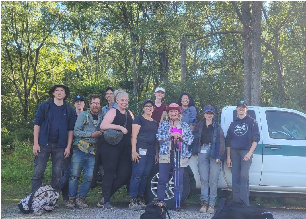
NCC Staff and Volunteers at the end of the 2025 Public Archaeology Dig.