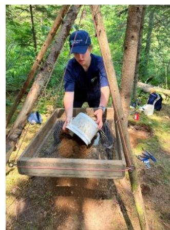
Excavation and screening activities at the Dickerson Site in 2024 and 2025